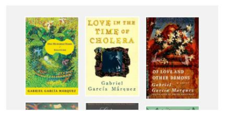
Colombian Authors >>